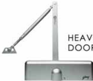
HEAVY DUTY DOOR CLOSER